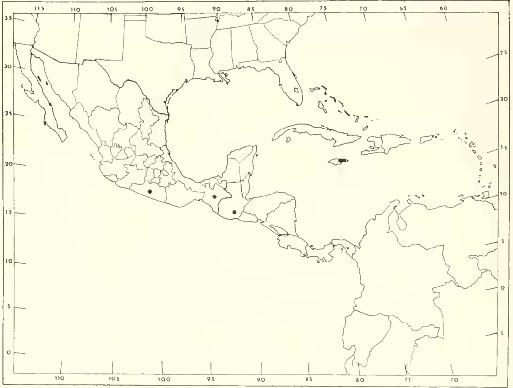
Fig. 2. Distribution of Fossispa lutena .

1.3 mm (avg. 1.1) ( n = 10 ); length 0.6 to 0.8 (avg. 0.7). Scutellum : brown; quadrate; longer than wide; micropunctate. Elytron : (Fig. 1). 8 rows of punctures at base, expands to 10 after middle; scutellar row of 3 punctures; punctures usually in double rows, but may be confused; 3 complete discal costae plus one short, weak costa on apical third, 1, 2, and 4 united on apical fifth; suture costate; elytral base explanate, expanded over base of pronotum; humeral angles strongly produced; raised areas on costae and between punctures micropunctate; margin serrate; apices cojointly rounded; at middle, puncture rows 5 and 6 enter longitudinal depression, expand to two additional rows divided by a weak costa; small depression between puncture rows 3 and 4 on basal third, 3rd interspace weakly costate; 4th costa highly carinate from humerus, the extent of projection variable, up to